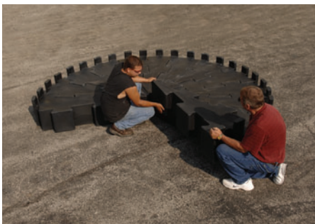
Two people can easily lift the interlocking pieces and slide them together as shown.

Assmann tested this stand to over 300,000 lbs. of crush force.