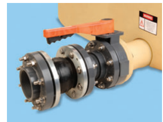
3" FDO (left) and 4" FDO (right) with flanged coupling, butterfly valve, and flexible expansion joint.